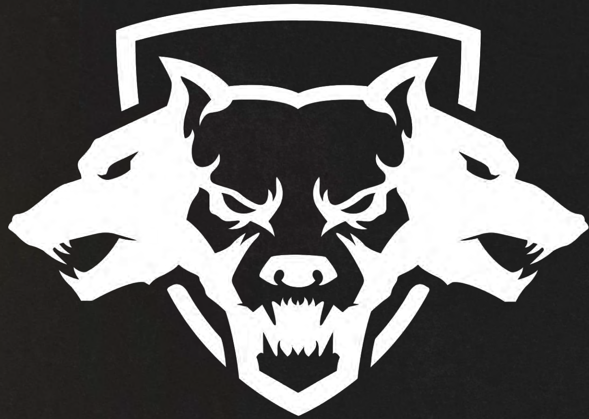
BRAND ICON – NEGATIVE ON DARK