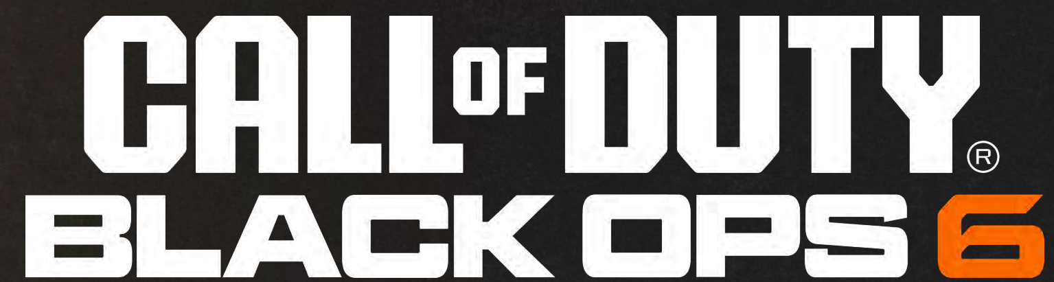
PRIMARY LOGO – NEGATIVE ON DARK